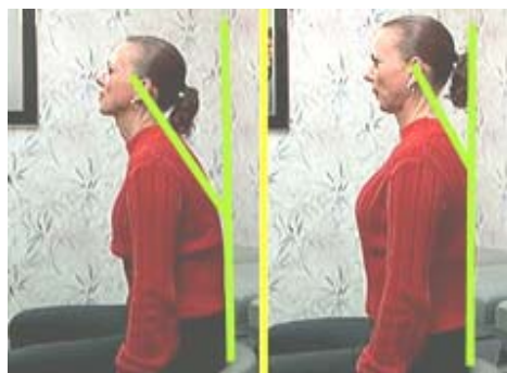
Changes in posture following a treatment with the ABC