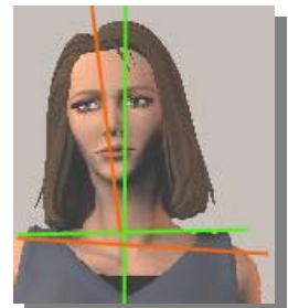
2. Head Cocked Posture