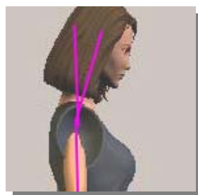
1. Head forward posture

illustrated. The so called cocked head posture Illustrated in figure 2 . Patients suffering from headaches will usually have one or both of these spinal distortions. And correcting these abnormal postures frequently reduces or even eliminates various types of headaches. Specific chiropractic adjustments can reverse these abnormal postures and provide excellent relief of headaches.