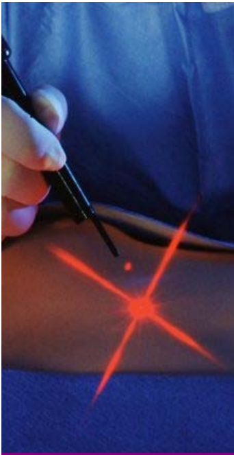
Figure 1, Laser light applied over the skin in a very specific wavelength has been shown to have potent biological effects. This specific form of light can alter nerve function, cause the release of pain suppressing chemicals in the brain and spinal cord, has also shown to promote tissue healing in wounds, accelerates tendon repair, skin damage and even speeds healing of patients after surgery.

Laser light is unique in its ability to penetrate the body. The illustration below demonstrates how a laser light beamed into a solid object can penetrate deep below the surface. Below is a picture of solid marble. You can see how the laser penetrates the surface of this slab of stone. In the human body, specific wavelength lasers can penetrate the skin and soft tissues creating healthful biological activity in the nerves, muscles, connective tissues and blood vessels. Properly applied, laser light therapy can promote healing and tissue repair. 11